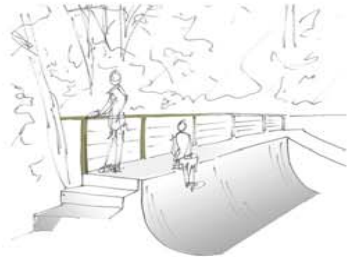
Sketch showing the proposed skateable space