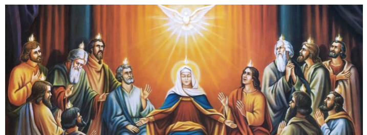
And all of them were filled with the Holy Spirit. Acts 2:4